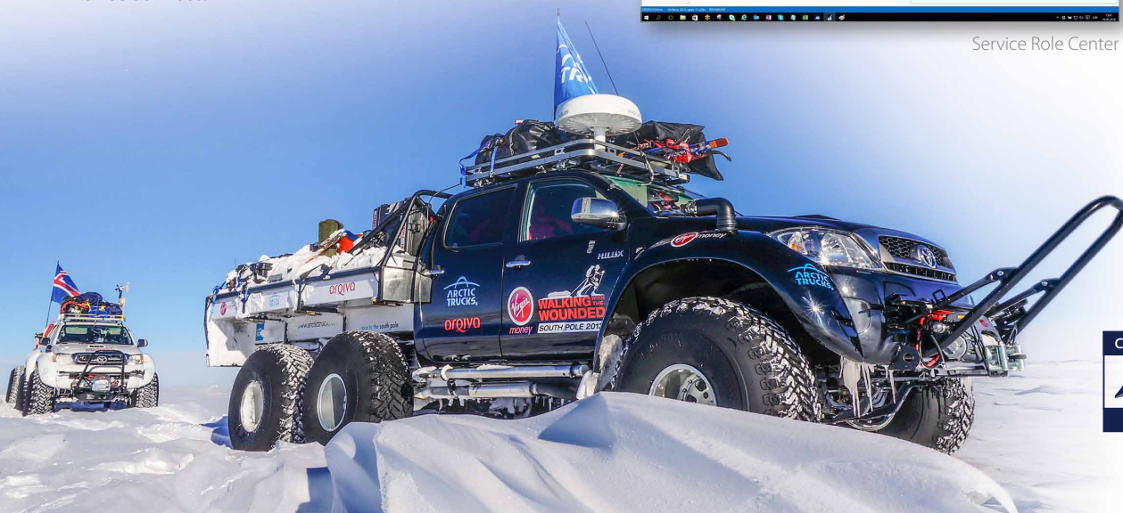
Service Role Center